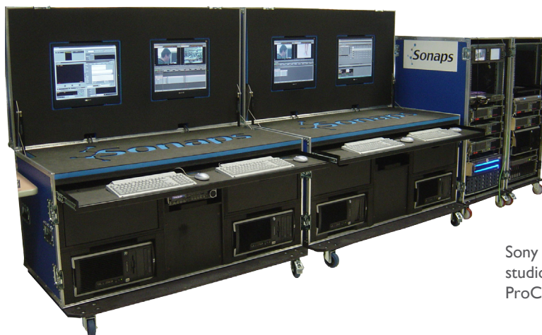
Sony Sonaps demonstration studio displayed in CP ProCases and ProRacks

Unit 11, Worton Hall Industrial Estate, Worton Road, Isleworth, Middlesex TW7 6ER England Tel: +44 (0) 20 8568 1881 Fax: +44 (0) 20 8568 1141 E-mail – info@cpcases.com Website – www.cpcases.com